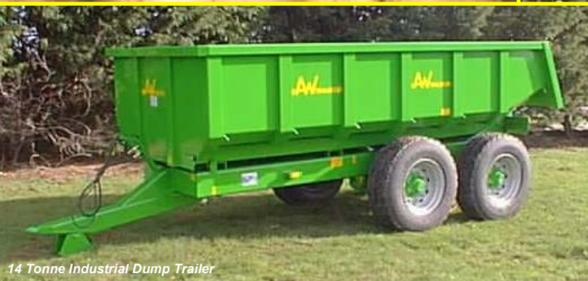
14 Tonne Industrial Dump Trailer

The AW Industrial Dump Trailers have a scow-ended body built from 6mm (1/4") thick plate supported by wide side channels. They have strong wide parallel chassis built from RHS or PFC and high specification running gear. The tandem axle models can be fitted with either sprung or bogie suspension. There are 6½ Tonne, 7 Tonne, 8 Tonne, 10 Tonne, 12 Tonne and 14 Tonne models available. There is also a 16 Tonne Industrial Dump Trailer available in our high spec Ultima range.