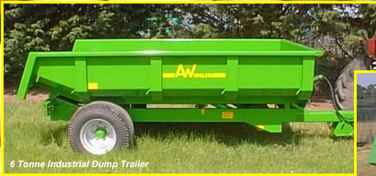
6 Tonne Industrial Dump Trailer