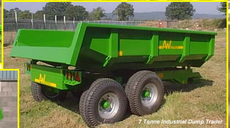
7 Tonne Industrial Dump Trailer