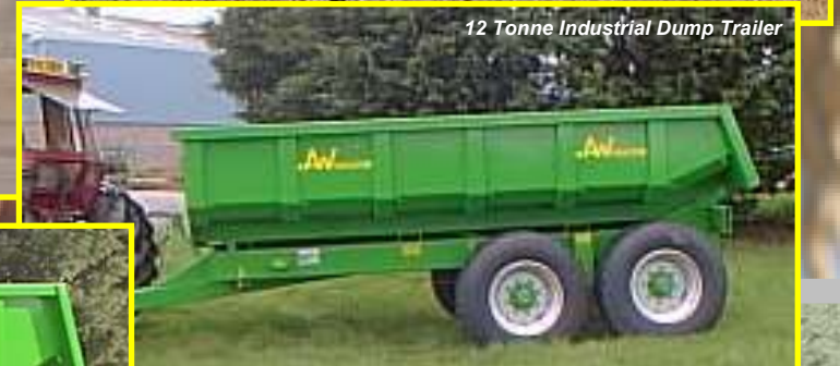
12 Tonne Industrial Dump Trailer