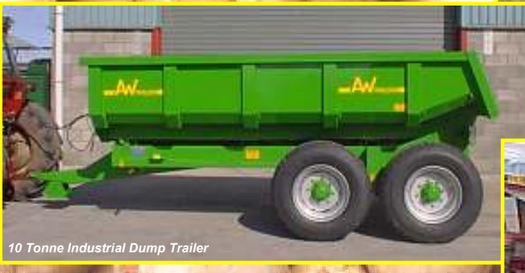
10 Tonne Industrial Dump Trailer